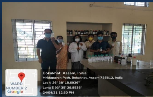
Department of Chemistry prepared hand sanitizer in the departmental laboratory