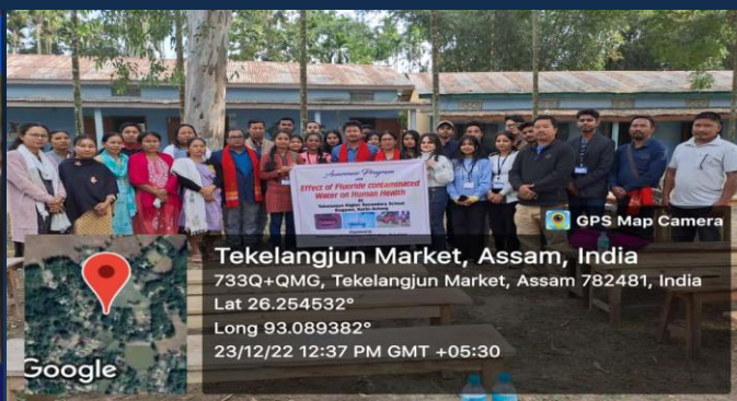
Every year a team of students and teacher of department of Chemistry visit fluoride or arsenic affected areas for generating awareness on safe drinking water.