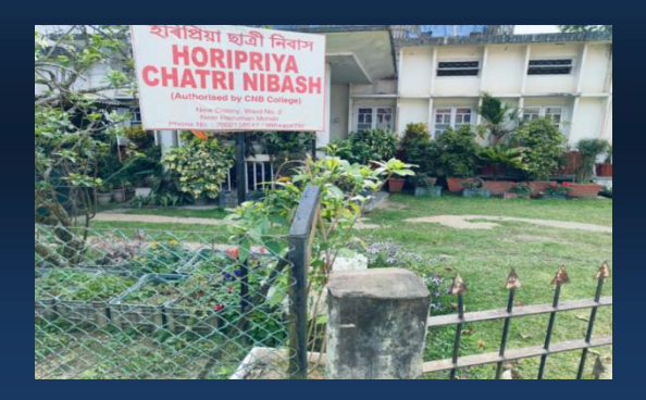
Our authorised hostels