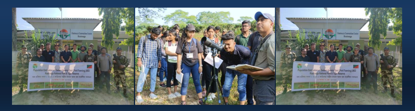
Students of CNB College perticipates in Kaziranga Mohutsov, Bird Festival, Bird census, Swamp Deer census etc in every year.